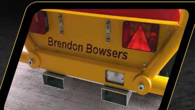
Optional Extra: Rear Forklift Points