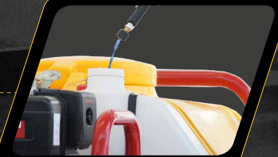
Integral Anti-Freeze & Detergent Tanks