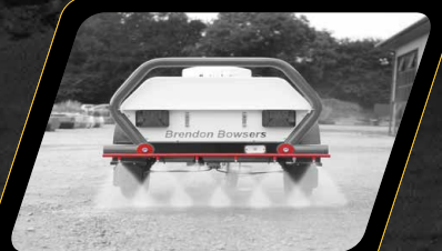
Optional Extra: Rear mounted spray bar for dust suppression