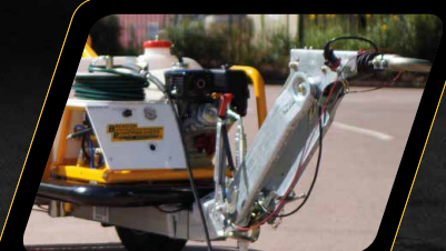
Choice of 50mm Ball or Eye couplings - Alko Adjustable Hitch available