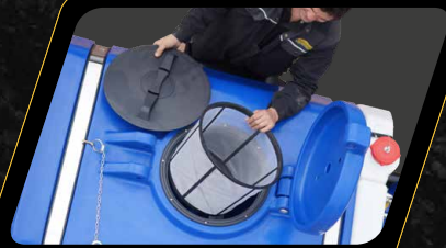
Lockable Hinged Tank Lid with removable Basket Filter