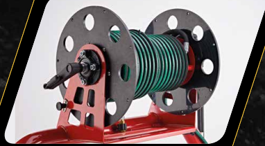
Optional Extra: Manual or 12V DC Electric Hose Reels for 30M - 100M of HP Hose