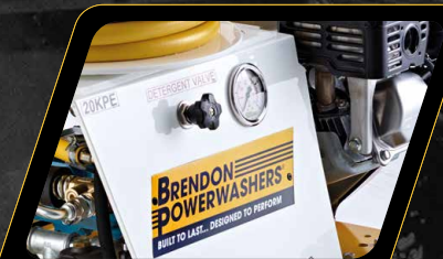
Polypropylene Canopy with Detergent Control Valve and Pressure Gauge