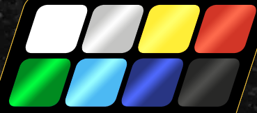
Large choice of Tank & Chassis Colour Combinations