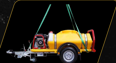
3 Point Lifting Points