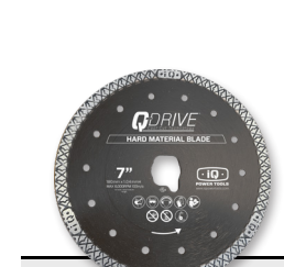
7" | TLD07-005P-QD-HM1 Hard Material Blade Granite and Porcelain SAW: IQ228CYCLONE SPECS: 180 mm/7"