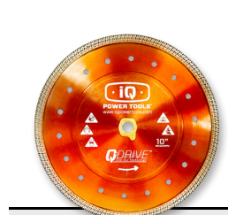
10" | TLD10-060P-QD-COMBO Combo Blade Marble, Porcelain, Granite, Stone, and Ceramic SAW: IQTS244 SPECS: 254 mm/10"