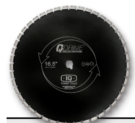
16.5" | MASQX16-125-QD-KP Segmented Combo Blade Concrete, Brick, Block, and Pavers SAW: IQMS362 SPECS: 420 mm/16.5"x .125