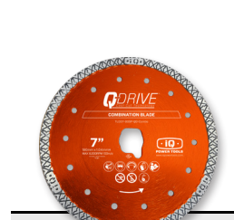
7" | TLD07-005P-QD-Combo Combination Blade Ceramic and Marble SAW: IQ228CYCLONE SPECS: 180 mm/7"