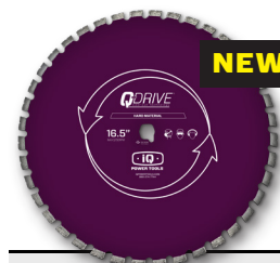
16.5" | MASQX16-125-QD-HM3 Segmented Super Hard Material Blade Extra hard Concrete, Stone, Granite, Brick, Pavers SAW: IQMS362 SPECS: 420 mm/16.5"x .125