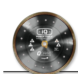
10" | TLD10-060P-QD-HARDMAT Hard Material Blade Granite, Porcelain, and other Hard Materials SAW: IQTS244 SPECS: 254 mm/10"