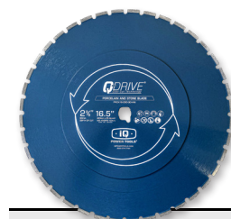
16.5" | PRGX16-090-QD-HM Segmented Porcelain and Stone Blade Porcelain, Stone, and Granite SAW: IQMS362 SPECS: 420 mm/16.5"x .125