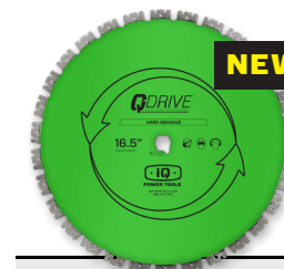
16.5" | MASX16-118-QD-MX Segmented Super Abrasive Material Blade Extremely Hard Materials with Abrasive Aggregates SAW: IQMS362 SPECS: 420 mm/16.5"x .125