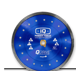
10" | TLD10-060P-QD-MB1 Soft Material Blade Marble, Travertine, and other Soft materials SAW: IQTS244 SPECS: 254 mm/10"